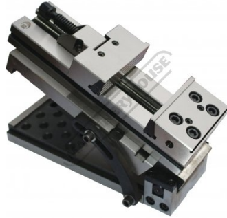
Shown with Optional Vice