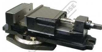
Shown without Handle