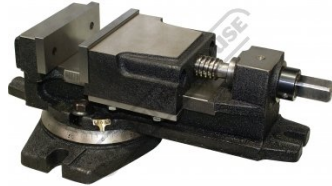
Shown without Handle