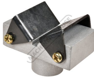
Included Larger Clamp Attachment