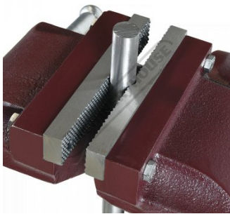
Pipe Vice Jaws