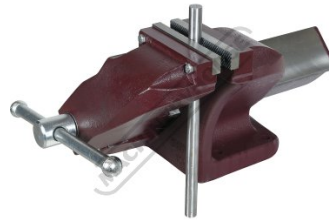
Side View Vertical Work Without Obstruction