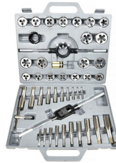
T015 Imperial Alloy Steel Tap & Die Set - 45 Piece