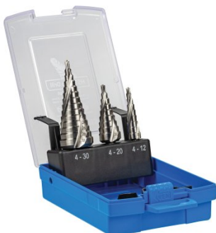
D107 HSS Step Drill Sets