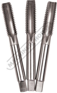
Starter Intermediate & Plug Tap