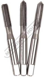
Starter Intermediate & Plug Tap