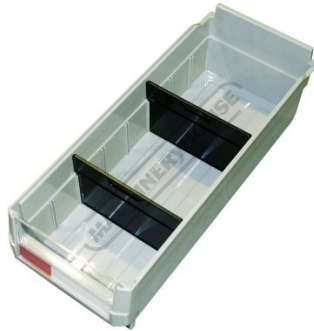
Parts Bin Top View