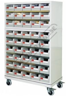
Shown with Additional Parts Bin and Mobile Base