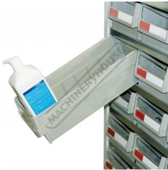
20kg Load With Safety Lip Design