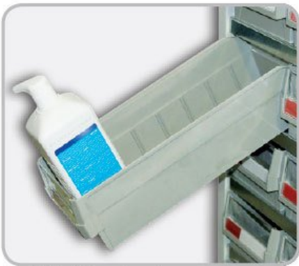
Safety Lip design