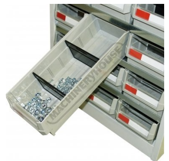
Drawer with Dividers Shown with Parts