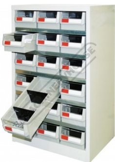
Drawers with Dividers