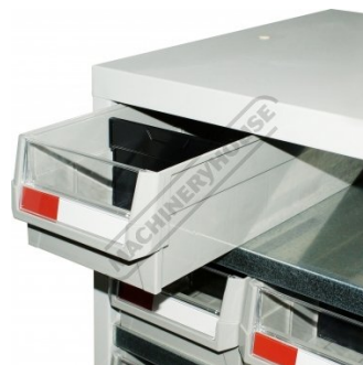
Parts Bin with Clear Window