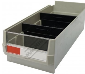
Parts Bin with Clear Window 164 x 375 x 105mm