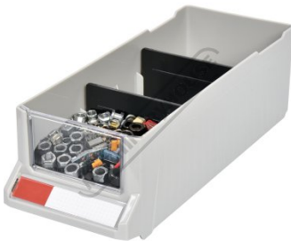
Parts Bin 90 x 218 x 70mm