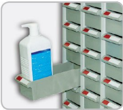
Safety Lip design