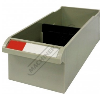
Parts Bin 90 x 218 x 70mm