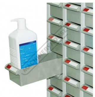
10kg Load With Safety Lip Design