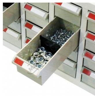
Drawer with Divider Shown with Parts