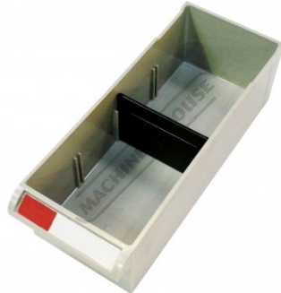
Parts Bin Top View