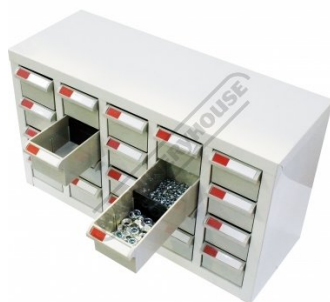
Top View Shown with Parts