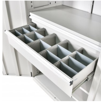
T763B Storage Cabinet Drawer