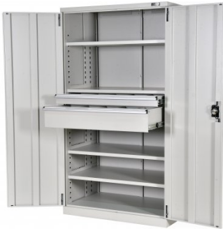
T763 Industrial Storage Cupboard