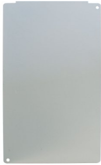
T789 Steel Divider