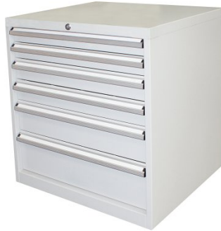
T767 6 Drawer - Industrial Tooling Cabinet