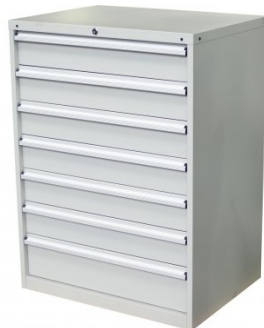
T772 7 Drawer - Industrial Tooling Cabinet