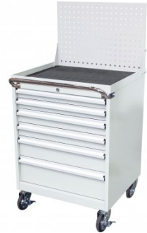
K068 6 Drawer - Industrial Mobile Tooling Cabinet with Backing Panel Package Deal