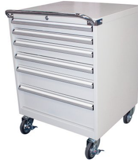
K068 6 Drawer - Industrial Mobile Tooling Cabinet with Backing Panel Package Deal