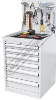
Shown with Optional Hooks & Cabinet - Tools Not Included