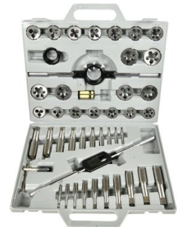
T014 Metric Alloy Steel Tap & Die Set - 45 Piece