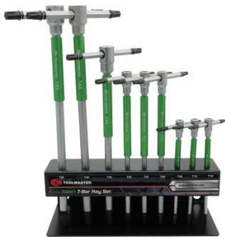
H822 Torx® Key Set with T-Bar Handle