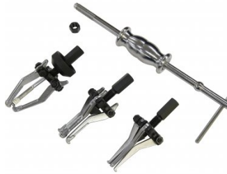
P013 Puller Set with Slide Hammer