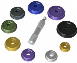
P031 Bearing Race & Seal Driver Set - 10 piece