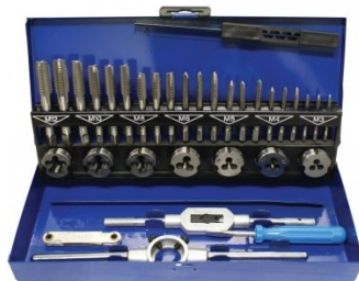
T012 Metric Alloy Steel Tap & Die Set - 32 Piece