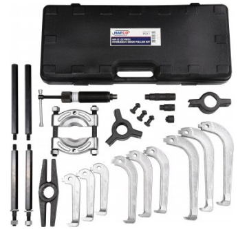
P011 Hydraulic Gear Puller Kit