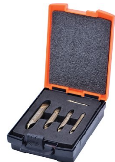
D508 HSS Industrial Centre Drill Set - 5Pcs