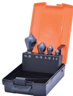
D1051 HSS Countersink Set (90° Cross Hole Type) - 4 Piece