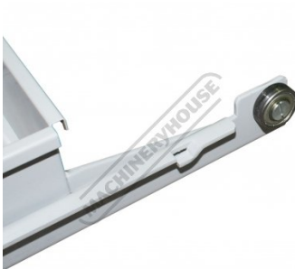
Drawer Ball Bearing Arms