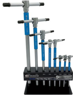
H820 Metric Hex Key Set with T-Bar Handle