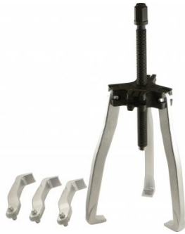
P005 Ratcheting Gear Puller Set