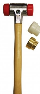
H870 Soft Face Hammer