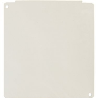
T788 Steel Divider