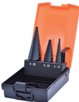
D1071 HSS Sheet Metal Step Drill Set - 3 Piece