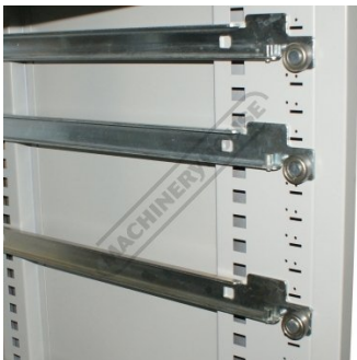
Heavy Duty Drawer Slides