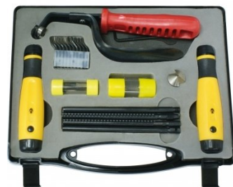
D065 Universal Deburring Tool Set - 23 Piece