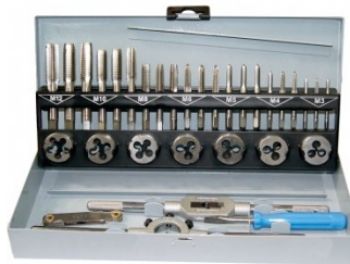
T014 Metric Alloy Steel Tap & Die Set - 45 Piece