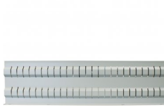
T787A Slotted Rail