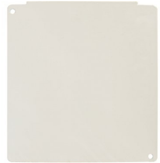
T788 Steel Divider