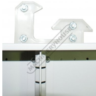
Drawer Lock Bracket