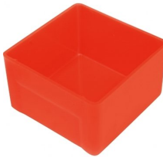
A427 Plastic Bucket