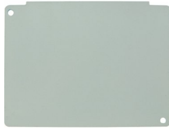
T787 Steel Divider