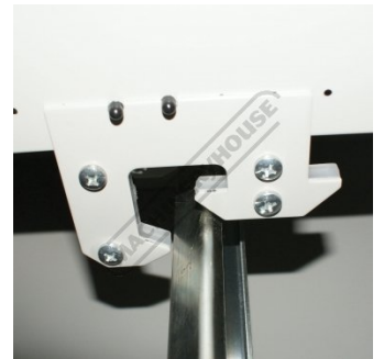
Drawer in Unlock Position