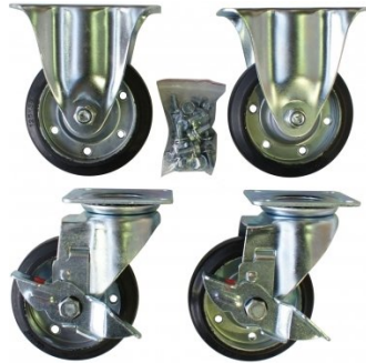
T776 Wheel Kit - Ø125mm