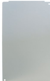
T789 Steel Divider