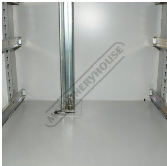
Drawer Locking Mechanism