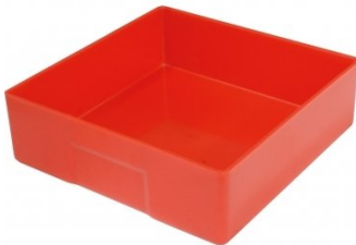
A429 Plastic Bucket