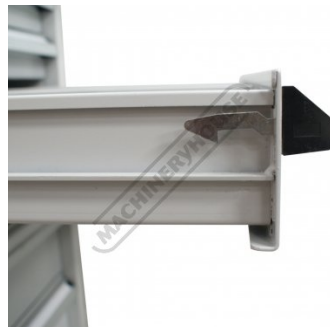
Drawers with Safety Lock