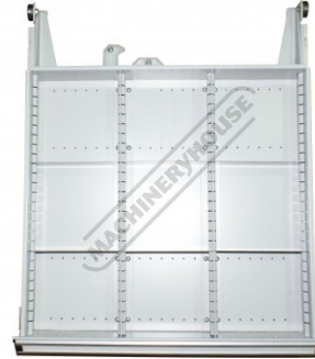
Heavy Duty Drawers