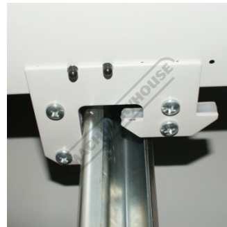
Drawer in Lock Position