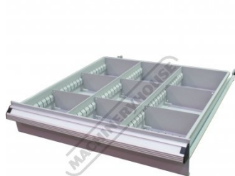
Drawers with Steel Dividers