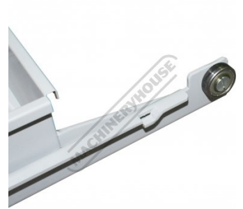
Drawer Ball Bearing Arms