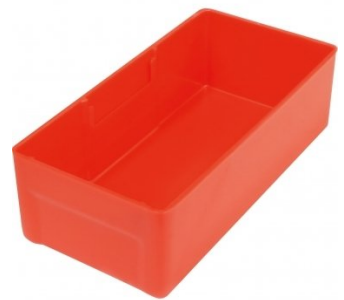
A428 Plastic Bucket