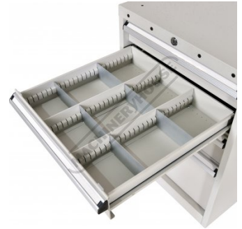
Draws With Adjustable Steel Dividers