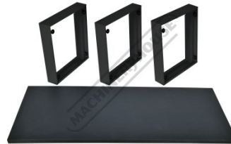
Optional Kick Board & Benchtop Kit