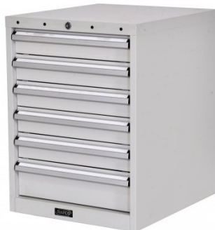
T7686 6 Drawer - Tooling Cabinet