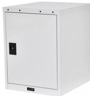
T7680 Tooling Cabinet