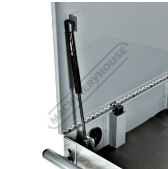
Gas Strut Lid