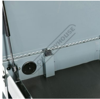
Draws Lock When Lid Closed