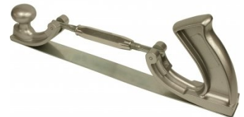
F150 Flexible Body File Holder