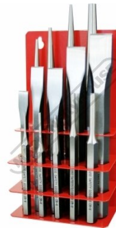
P364 Punch & Cold Chisel Set - 14 Piece