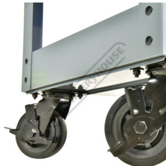
Wheels With Brake System