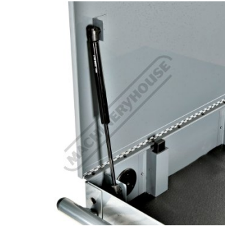
Gas Strut Lid