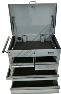
Protective Draw Lining