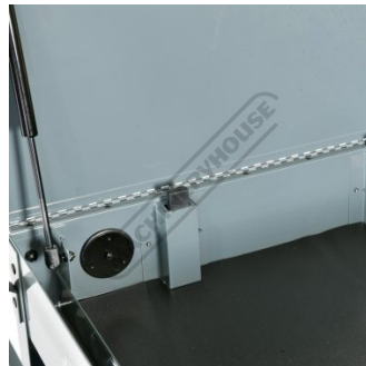
Draws Lock When Lid Closed