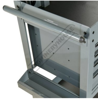
Cart Handle-Side Tray