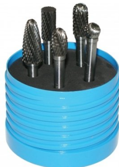
B900 Carbide Burr Double Cut Set - Short Series