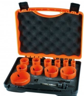
D102 Metric HSS Hole Saw Set