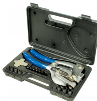
S203 180° Straight Edge/Seaming Plier