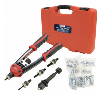
N001 Nut & Blind Riveter Set - 130 Piece