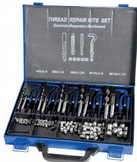
T100 Metric Thread Repair Kit - 130 Piece