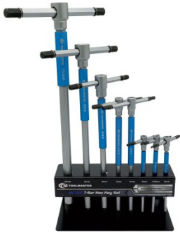
H820 Metric Hex Key Set with T-Bar Handle