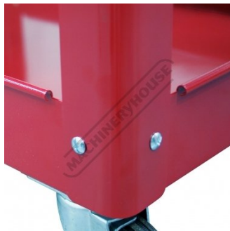
Rolled Safety Edges on Bottom Shelf