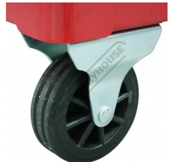
2 x Fixed Wheels