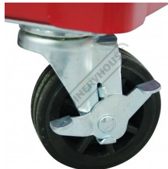
2 x Swivel Brake Wheels