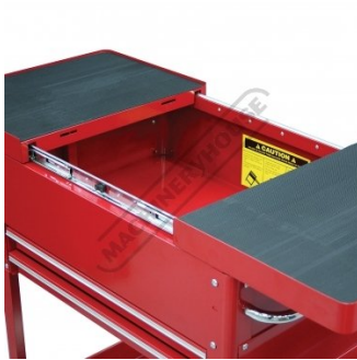
Sliding Top for Storage