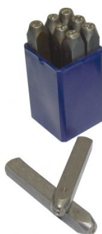
P351 Number Punches