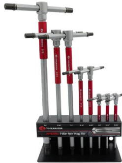
H821 Imperial Hex Key Set with T-Bar Handle