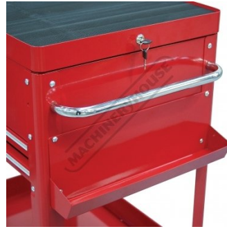
Push Handle and Tool Storage Tray