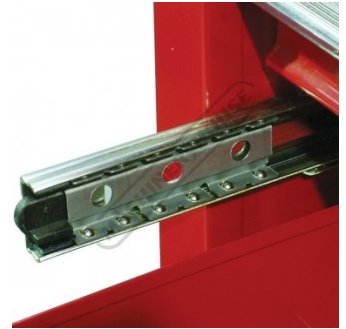
Ball Bearing Slides