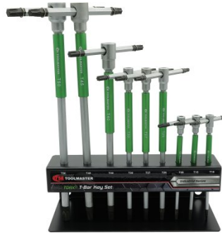
H822 Torx® Key Set with T-Bar Handle