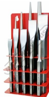
P364 Punch & Cold Chisel Set - 14 Piece