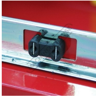
Magnetic on Sliding Top