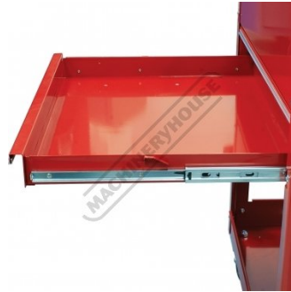
Drawers with Ball Bearing Slides