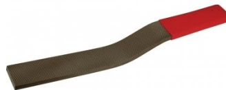
F150 Flexible Body File Holder