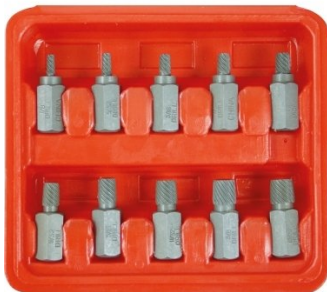
T870 Screw Extractor Set - 10 piece