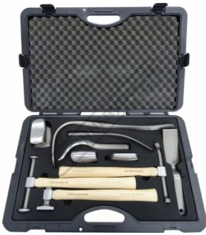
H887 Auto Panel Restoration Kit - Master