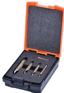
D508 HSS Industrial Centre Drill Set - 5Pcs