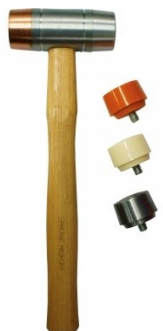
H875 Soft Face Hammer - 5 piece