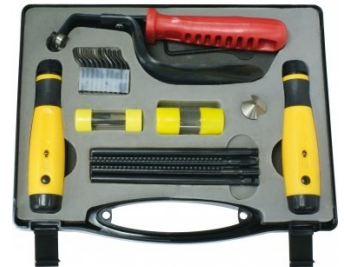
D065 Universal Deburring Tool Set - 23 Piece