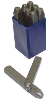
P355 Number Punches