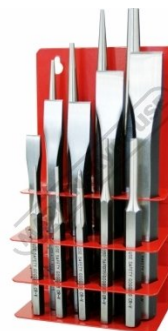
P364 Punch & Cold Chisel Set - 14 Piece