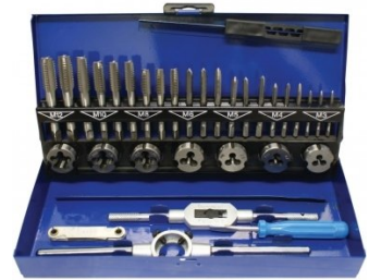
T012 Metric Alloy Steel Tap & Die Set - 32 Piece