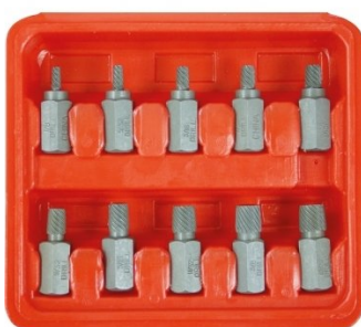
T870 Screw Extractor Set - 10 piece