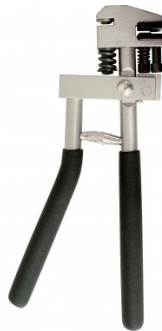
S200 Joggler & Punch Plier