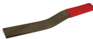
F160 Slapping File - Second Cut