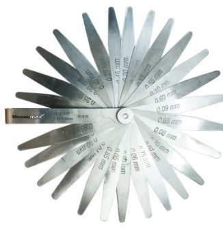
Q616 Feeler Gauge Set