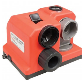
D070 Drill Sharpener