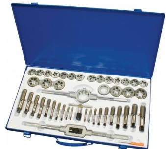
T016 Metric HSS Tap & Die Set - 45 Piece