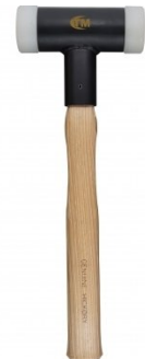
H880 Dead Blow, Nylon Face Hammer