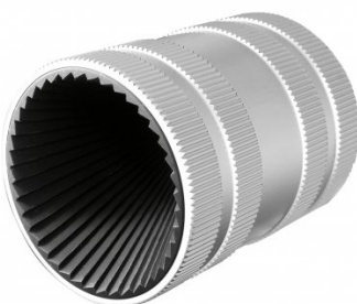
D068 Pipe/Tube Deburring Tool - Internal / External