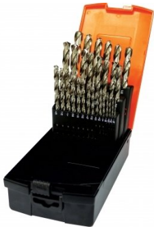
D1282 Imperial 135° Precision HSS Drill Set - 29 Piece