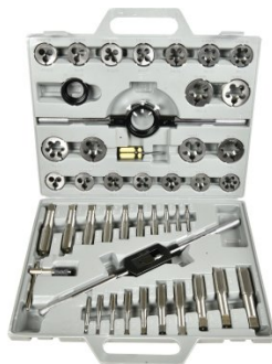
T014 Metric Alloy Steel Tap & Die Set - 45 Piece