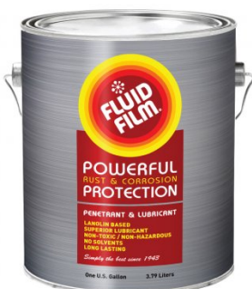
O044 Rust & Corrosion Preventive