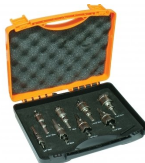
D108 Metric Carbide Tipped Hole Saw Set