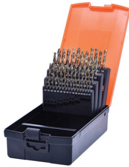
D1285 Metric 135° Precision HSS Drill Set - 51 Piece