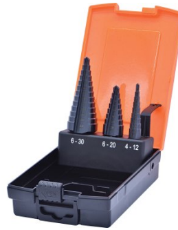
D1071 HSS Sheet Metal Step Drill Set - 3 Piece