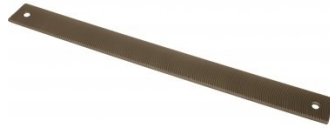
F156 Flexible Body File