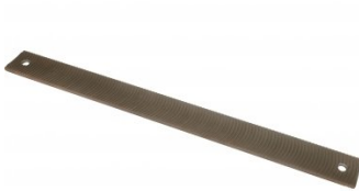
F155 Flexible Body File