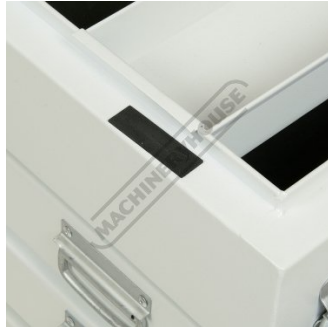
Cushion Pad for Lid