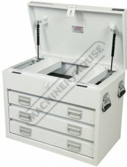
Shown With Lid Open