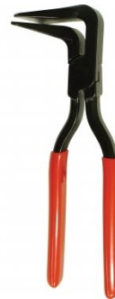
S205 90° Edge/Seaming Plier