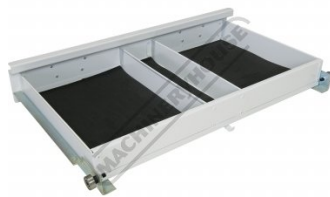
Drawer Rear View