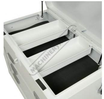
Top Two Storage Trays