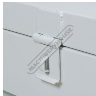
Latch For Optional Pad Lock