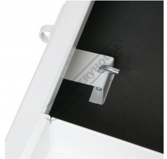
Safety Lock For Drawers