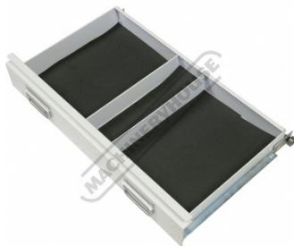
2 x Drawers with Dividers