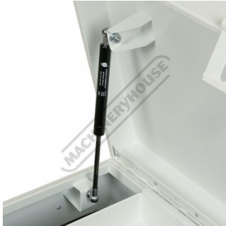
Left Gas Strut