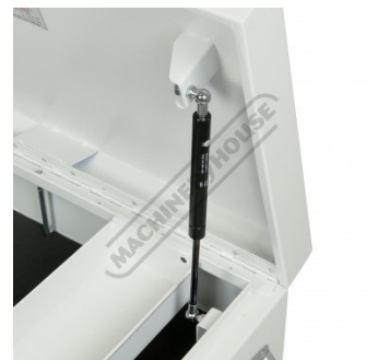
Right Gas Strut