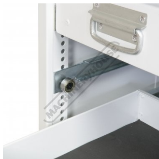
Drawer Runner with Ball Bearing