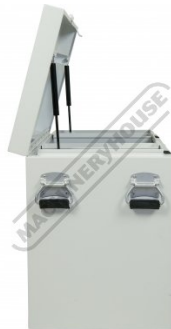
Side View Lid Open