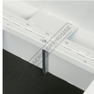
Full Length Piano Hinge Lid