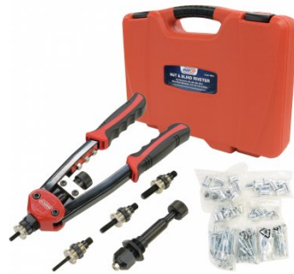
N001 Nut & Blind Riveter Set - 130 Piece