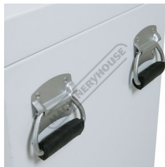
Side Lifting Handles