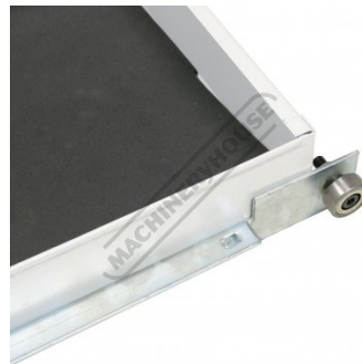
Drawer with Roller Ball Bearing