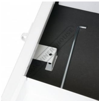
Safety Pin For Drawers Lock