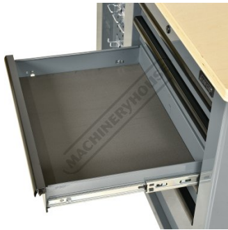
Protective Drawer Liners