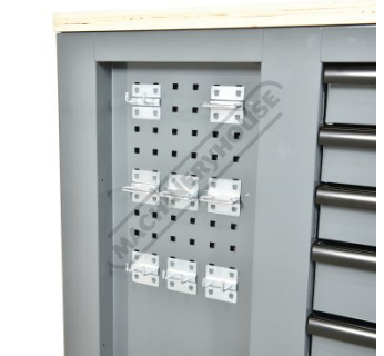
Slots for Hanging Hooks