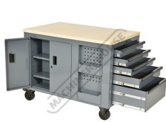
Rear View Drawers Open