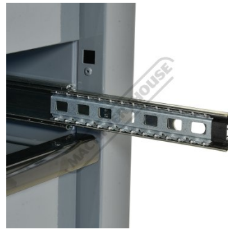
Ball Bearing Slide Drawers