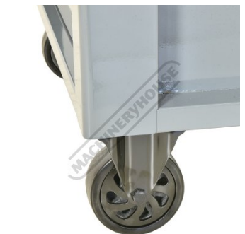
2 x Fixed Wheels