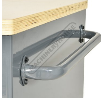
Heavy Duty Push Handle