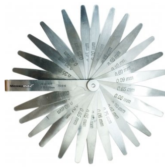
Q616 Feeler Gauge Set