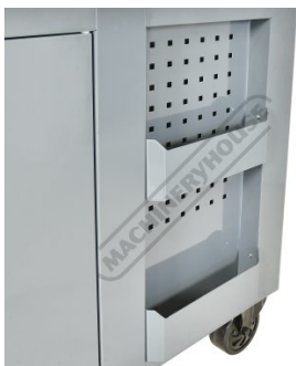
Rear Storage Holders and Slots for Hanging Hooks