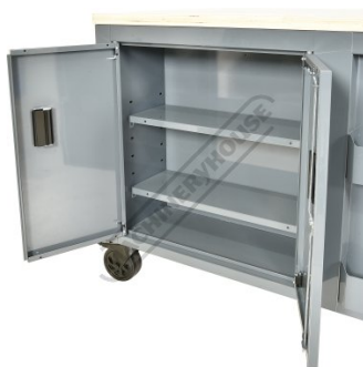
Key Lockable Cabinet with 2 Adjustable Shelves