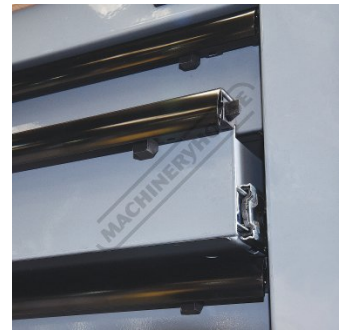
Drawer Latches on each Drawer