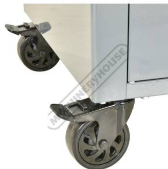
2 x Swivel Brake Wheels