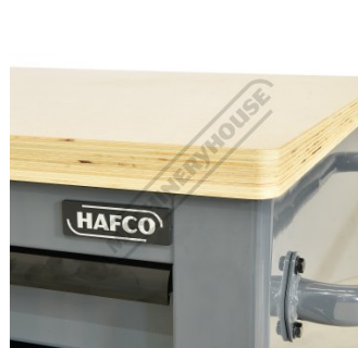
Wooden Bench Top