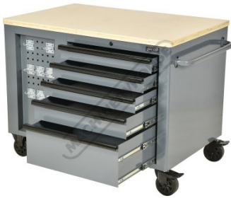
Front View Drawers Open