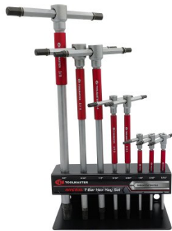
H821 Imperial Hex Key Set with T-Bar Handle