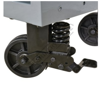
2x Swivel Brake Wheels