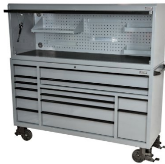
T6838 Professional Series Top Hutch & Roller Cabinet - Package Deal