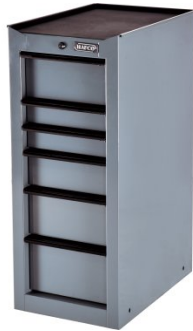
T6888 Professional Series Side Cabinet