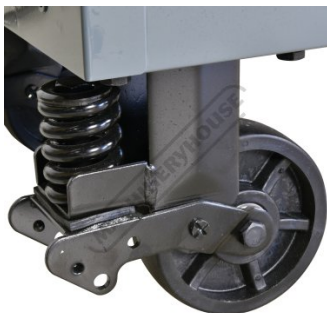
2x Fixed Wheels