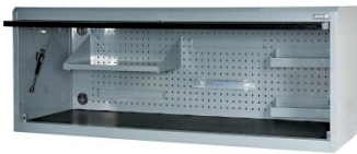
T6886 Professional Series Top Hutch