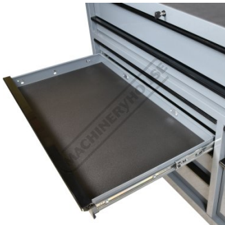
Protective drawer liners