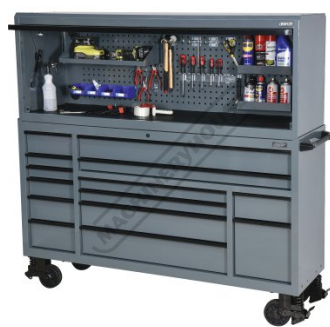
Shown with Optional TPS72H Top Hutch and Tools