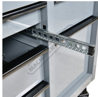
Ball Bearing Slide Drawers