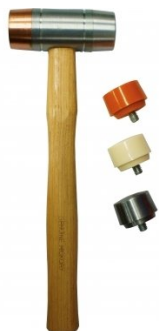
H875 Soft Face Hammer - 5 piece