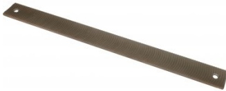
F155 Flexible Body File