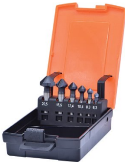
D1061 HSS Countersink Set (90° 3 Flute Type) - 6 Piece