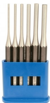
P365 Pin Punch Set - 6 Piece