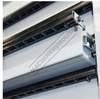
Full Width Drawer Opening Latch