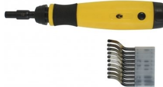
D065 Universal Deburring Tool Set - 23 Piece