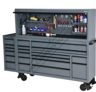
Shown with Optional TPS 65D Side Cabinet and TPS 72H Top Hutch and Tools