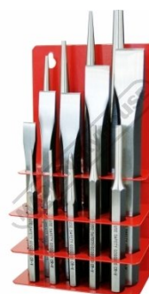
P364 Punch & Cold Chisel Set - 14 Piece