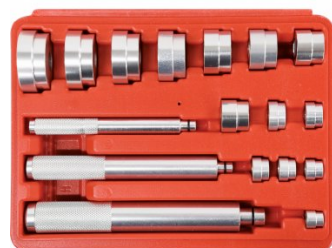
P031 Bearing Race & Seal Driver Set - 10 piece