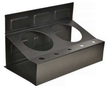
T703 Magnetic Spray Can & Screwdriver Holder