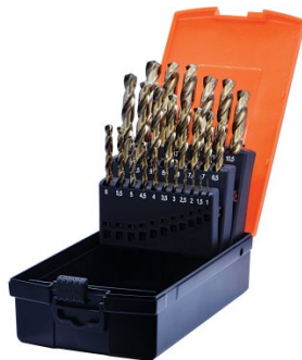
D1282 Imperial 135° Precision HSS Drill Set - 29 Piece