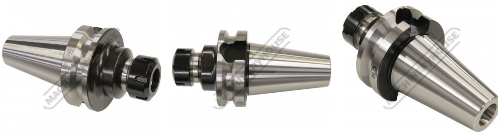
Front Right View