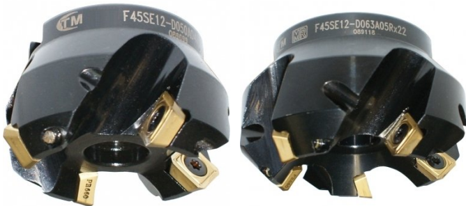
M516 Face Mill 45° - Super High-Rake