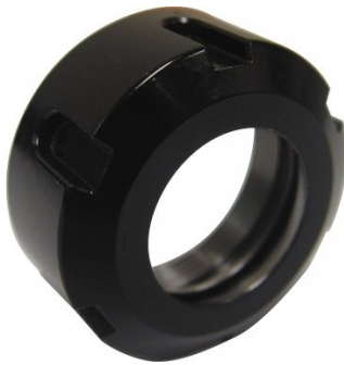
C117 Collet Nut ER32