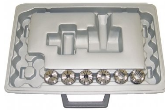
C921 ER32 Collet Set - 6 Piece