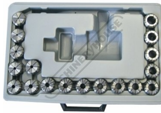
C922 ER32 Collet Set - 18 Piece