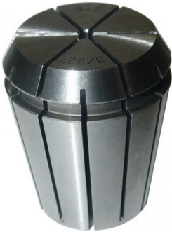
C903 ER32 Collet