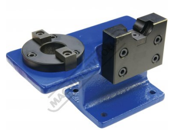
Right Top View