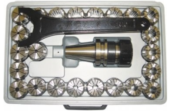
C967 Collet & Chuck Set - 25 Piece