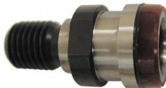
T144 Pull Stud