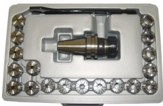
T142 Pull Stud