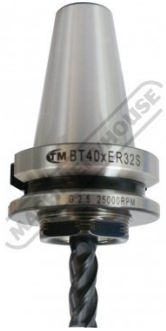
Shown with Optional Cutter