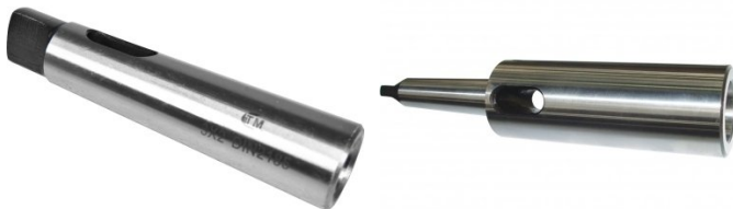
D403 Drill Extension Sleeve - Morse Taper