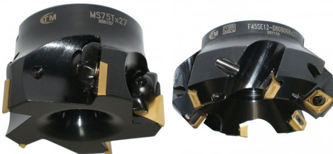
M517 Face Mill 45° - Super High-Rake