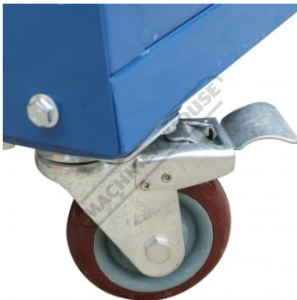
Swivel Wheel With Brake