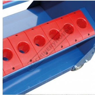
Bottom Shelf Tooling