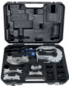
Plastic Carry Case