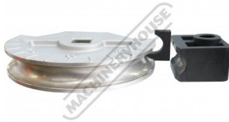
Former & Follower Die Side View