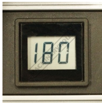
Digital Readout Angle 0~180°