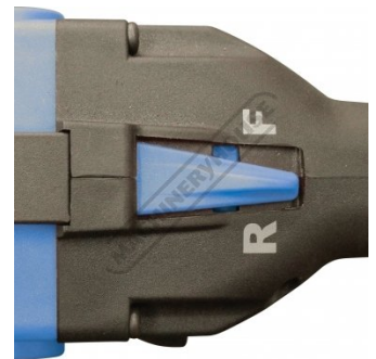
Forward Reverse Switch