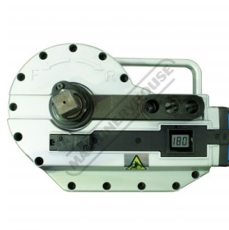
Main Body Top View