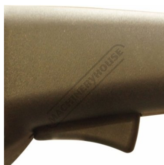
Bending Trigger Switch