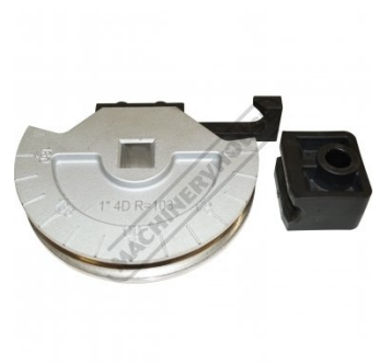
1" Inch Former & Follower Die