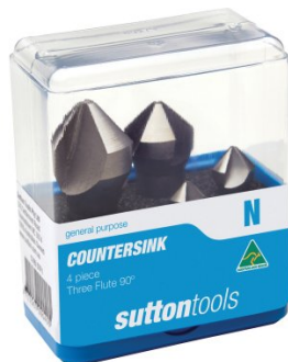
D106 Countersink Sets – 90° Three Flute