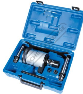
Blow Mold Case