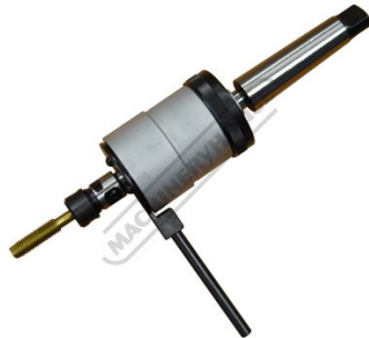
Shown With Tapper