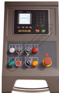
NC Estun E21 Controller