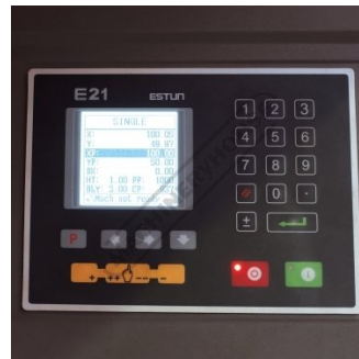
NC Estun E21