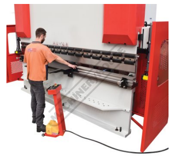
Laser Guarding system In Use