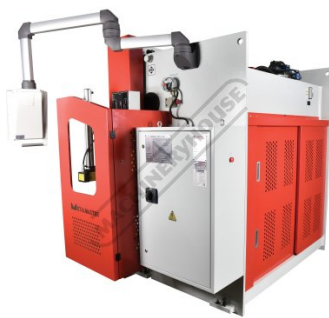
Enclosed Rear Safety Guarding