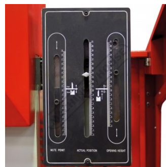
Adjustable Travel Limit Control