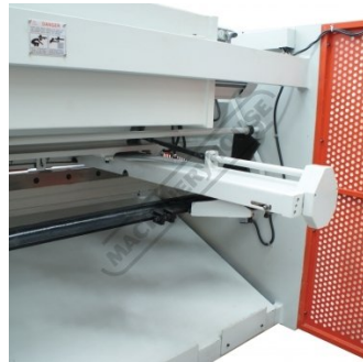
Motorised Back Gauge