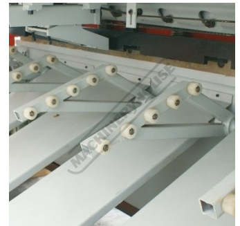
Sheet Supports Close Up