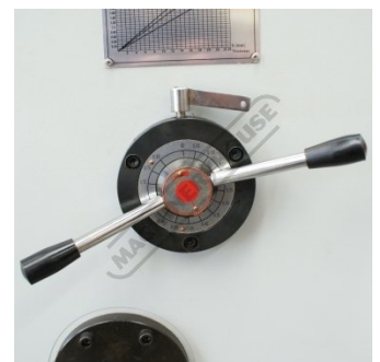
Blade Clearance Adjustment Lever