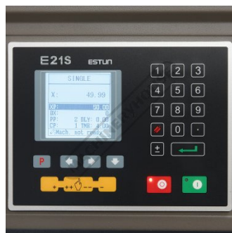
Estun E21S Controller