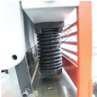
Hydraulic Material Hold Downs