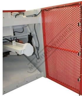
3 x Photo Electric rear guarding