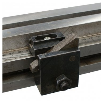
Flip Over Material Stop