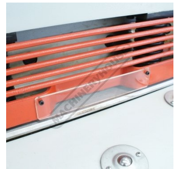
See Through Safety Guard