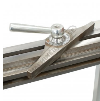
Adjustable and Sliding Mitre Guide