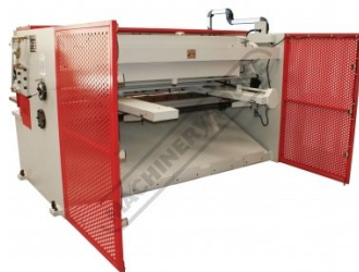
Rear Guarding View