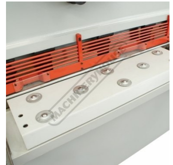
Material Transfer Balls On The Table