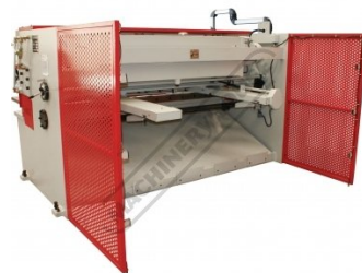
Rear Guarding View