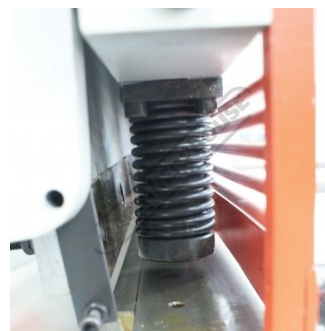
Hydraulic Material Hold Downs