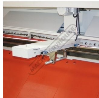
Motorised Backgauge Right View