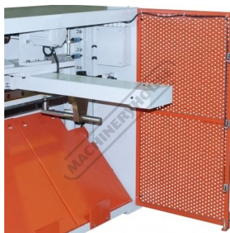
3 Safety Photo Sensors