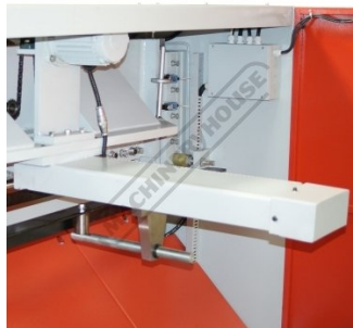
Motorised Backgauge Close Up