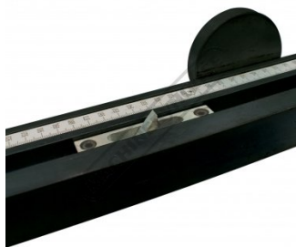
Squaring Arm with Flip Over Stop