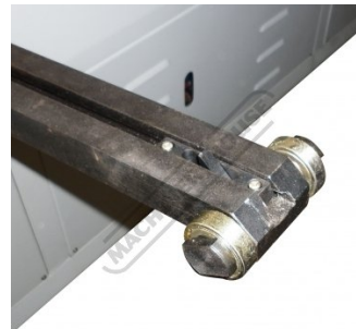
Front Sheet Supports with Roller Bearings