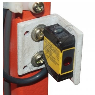
Safety Omron E3ZS Rear Light Sensor Guarding