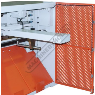
3 Safety Photo Sensors