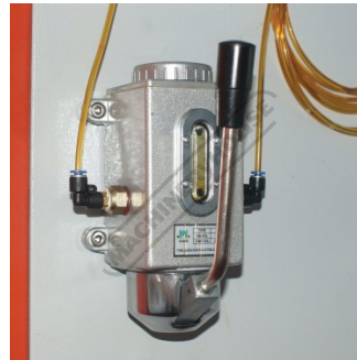
One Shot Lubrication