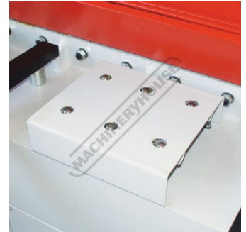
Material Transfer Ball On the Table