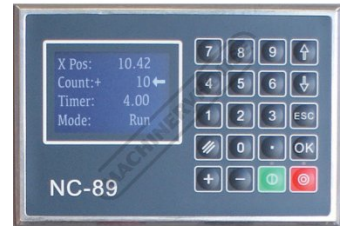
NC 89 Backgauge DRO