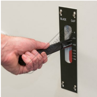
Quick Action Blade Clearance Adjustment Operation