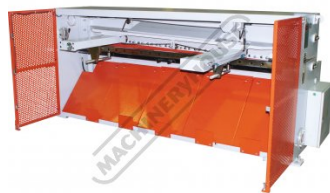
NC 89 Control Backgauge