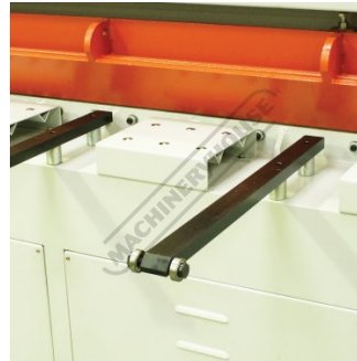
Front Sheet Supports with Roller Bearings