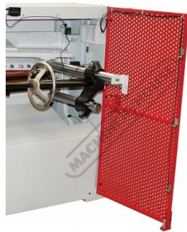
3 Safety Electro Photo Sensors