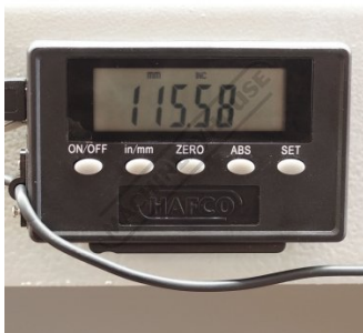
Backgauge Digital Readout