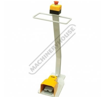
Roving Foot Pedal with Emergency Stop