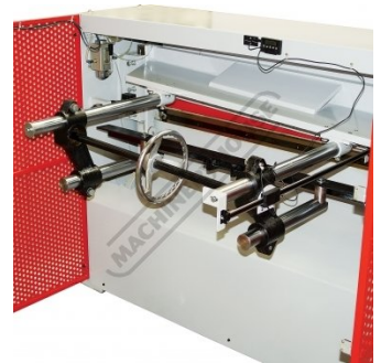
Manual Backgauge with Digital Readout