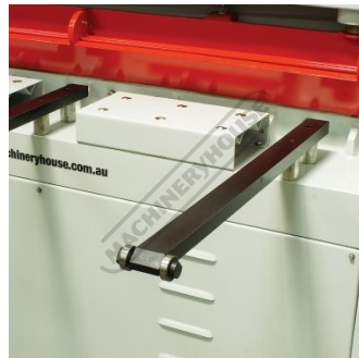
Front Sheet Supports