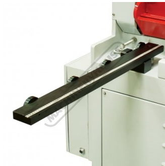
Squaring Arm with Measuring Scale