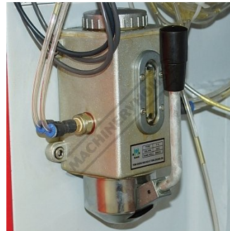
One Shot Lubrication