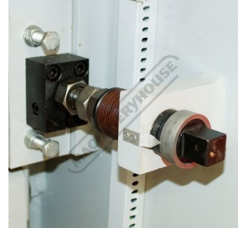
Quick Action Blade Clearance Adjustment