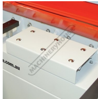
Material Transfer Balls on Table