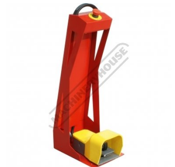
Roving Foot Control