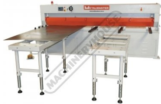
Shown with Optional Ball Transfer Tables - Order Code (L840)