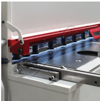
Squaring Arm with Adjustable Stop