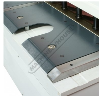
Ball Transfer Table