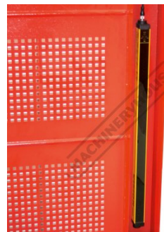
Rear Light Guarding