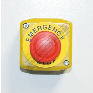
Emergency Stop Switch