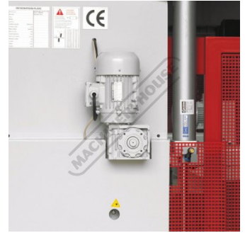
Motorised Blade Gap System