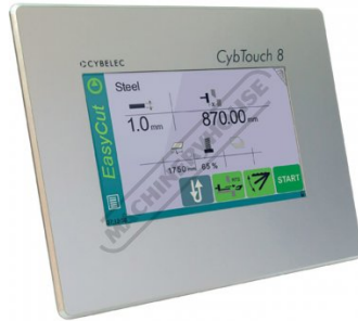
Cybelec Cybtouch 8W Control Unit