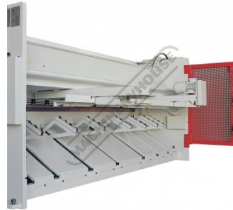
Pneumatic Sheet Supports Type A