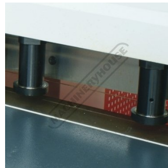
Material Shadow Line