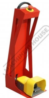
Roving Foot Control