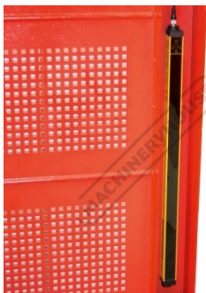
Rear Light Guarding