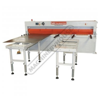
Shown with Optional Ball Transfer Tables - Order Code (L840)