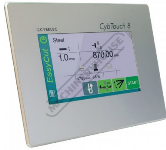
CybeleC Cybtouch 8W Control Unit