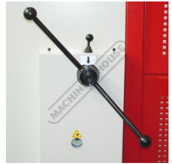
Blade Gap Adjustment Lever