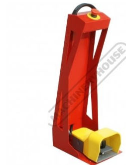
Roving Foot Control