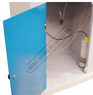
Storage Cabinet With Oil Refill Bottle