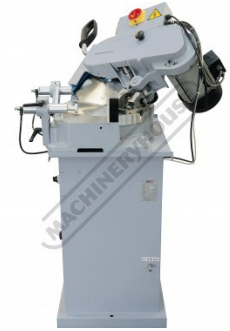
Compound Cut at 45 Degrees Right View