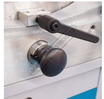
Swivel Head Release