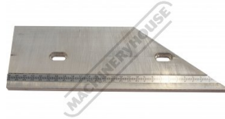
Tilting Head Rear Material Support Included