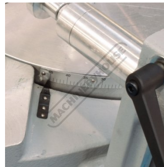
Swivel Head Scale Indicator