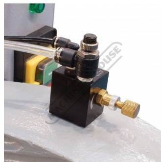
Spray Mist Coolant Control