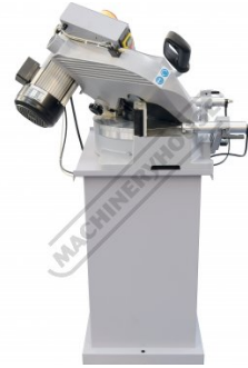
Compound Cut at 45 Degrees Left View