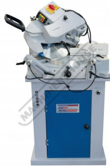
Compound Cut at 45 Degrees