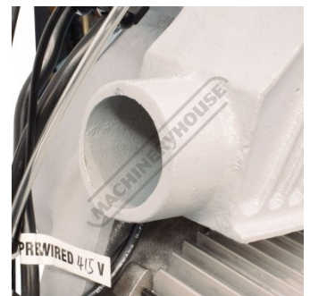
Dust Extraction Chute